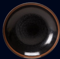
Coupe Bowl 91090569 * D 10" (38 oz) 91090570 * D 8 1/2" (27 oz) 91090571 * D 5" (4 oz)