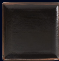
Square Plate 91090553 * L W 10 5/8"