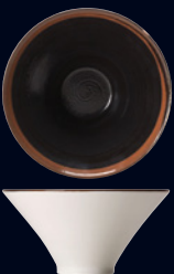
Axis Bowl 9109C487 D 8" H 4" (38 oz) 9109C488 D 6" H 3" (16 oz) 9109C489 D 3 1/2" H 2" (4 oz)