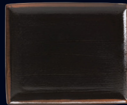
Rectangle Tray 91090551 * L 13 1/2" W 10 5/8"