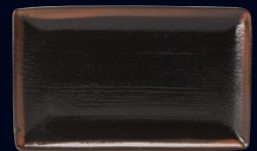
Rectangle Tray 91090556 * L 12 1/2" W 7 1/2" 91090552 * L 14 1/2" W 6 1/2" 91090550 * L 10 5/8" W 6 1/2"