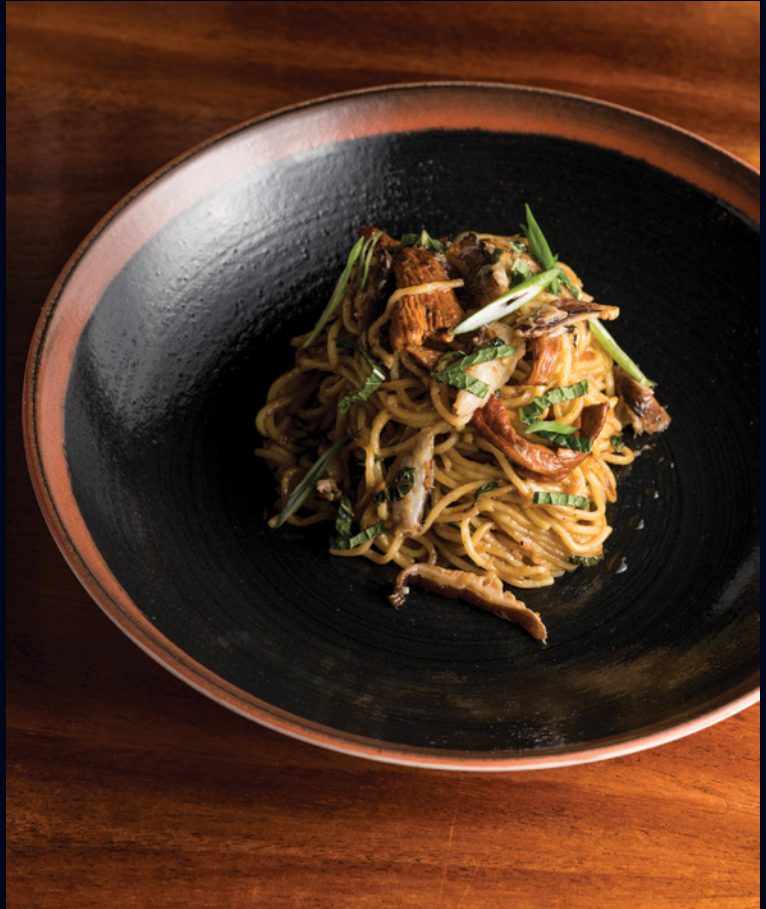
Coupe Bowl 91090569 * D 10" (38 oz)