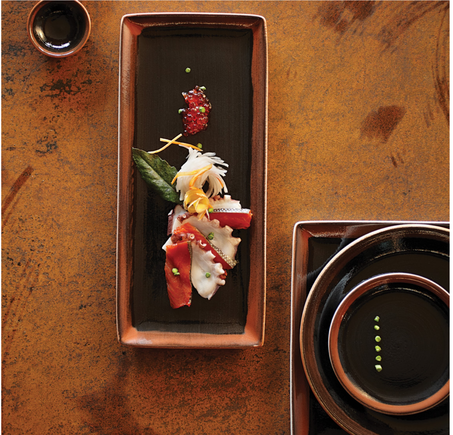
9109 Assorted Koto Items