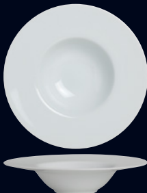
Top Hat Pasta Bowl 61101ST0277 D 11" H 2 1/2" (15 oz) (Plate Cover 5379S808)