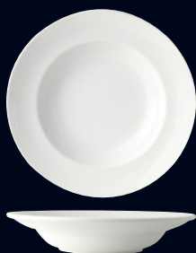
Pasta Bowl 61101ST0275 D 11 3/4" H 2 3/4" (22 oz) 61101ST0278 D 10 1/4" H 2 1/8" (18 oz) (Plate Cover 5379S791)