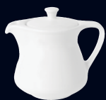
Teapot w/Lid 61101ST0294 L 5" H 4 1/2" (11 oz) Replacement Lid 61101ST0295