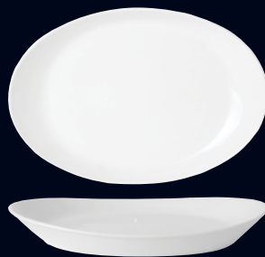
Oval Winged Coupe Platter 61101ST0260 L 15 1/8" W 10 3/8" H 1 7/8" 61101ST0261 L 13 1/2" W 9 3/8" H 1 3/4" 61101ST0262 L 11 1/8" W 7 5/8" H 1 3/8"