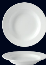
Rim Soup 61101ST0279 D 9 1/4" H 1 5/8" (12 oz)