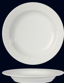
Pasta Bowl 61101ST0276 D 11" H 1 5/8" (21 oz) (Plate Cover 5379S808)