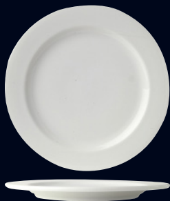
Plate 61101ST0250 D 12 1/2" 61101ST0251 D 11 7/8" (Plate Cover 5379S789) 61101ST0252 D 11" (Plate Cover 5379S808) 61101ST0253 D 10 1/4" (Plate Cover 5379S791) 61101ST0254 D 9 1/2" 61101ST0255 D 8 1/8" 61101ST0256 D 7" 61101ST0257 D 6 3/8"