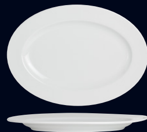
Oval Dish 61101ST0263 L 14 1/2" W 10 1/4" 61101ST0264 L 12 5/8" W 9 1/4" 61101ST0265 L 9 1/4" W 6 1/2"