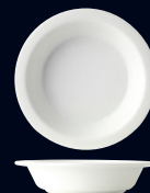
Cereal Bowl 61101ST0282 D 6 3/4" H 1 1/2" (11 oz)