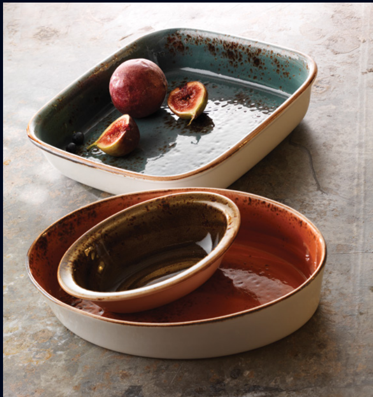
Assorted Craft Roasters and Bakers