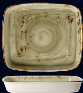
Oblong Roaster 0331 L 14" W 12" (125 oz) 0342 L 12" W 10" (80 oz)