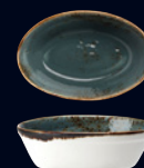
Oval Baker 0400 D 6 1/4" (13 oz) 0328 Lipped D 6 1/4" (13 oz)