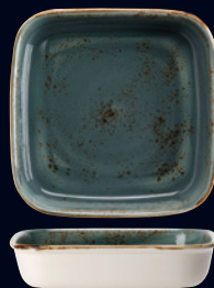
Square Roaster 0329 L W 10" (65 oz)