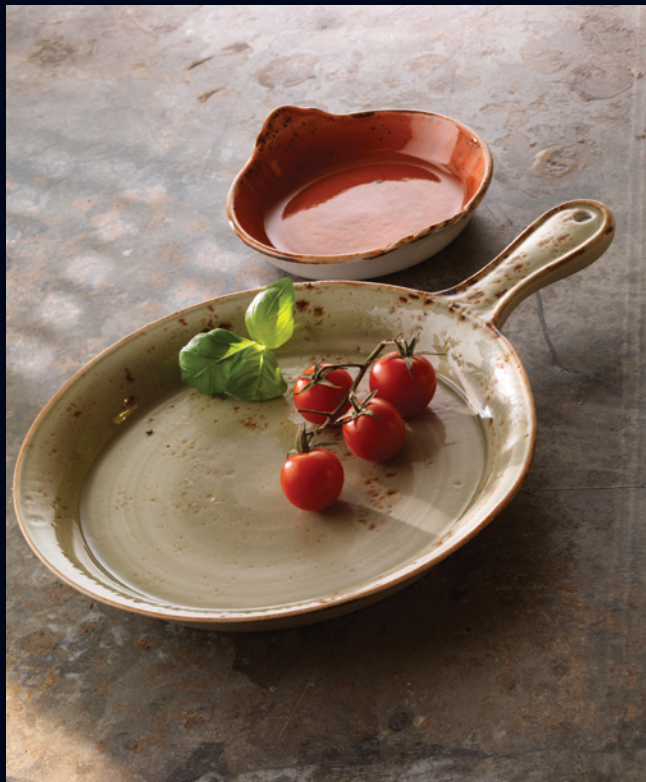
Presentation Pan 11310866 D 10" (33 1/2 oz) Round Eared Dish 11330317 D 8 1/2" (27 oz)