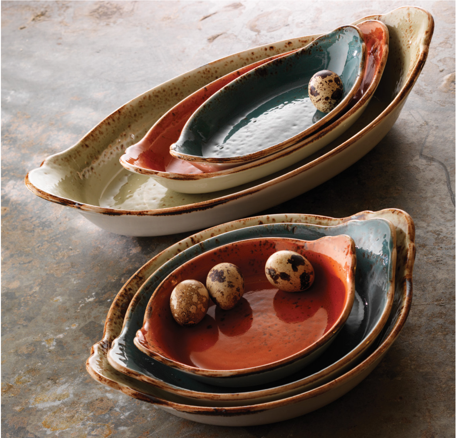
Assorted Craft Oval and Round Eared Dishes