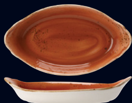
Oval Eared Dish 0321 L 13 1/2" W 7 1/2" (36 1/2 oz) 0320 L 12" W 6 1/2" (27 1/2 oz) 0319 L 9 1/2" W 5 1/2" (12 1/2 oz) 0318 L 8" W 4 1/2" (6 1/2 oz)