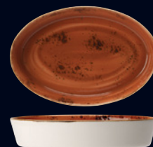
Oval Sole Dish 0326 L 11" W 7 1/2" (52 oz) 0327 L 8 1/2" W 5 1/2" (19 oz)