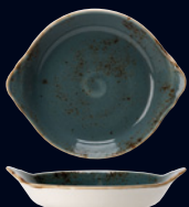
Round Eared Dish 0317 D 8 1/2" (27 oz) 0316 D 7 1/2" (19 oz) 0191 D 5 3/4" (6 1/2 oz)