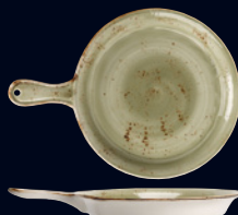
Presentation Pan 0866 D 10" (33 1/2 oz)