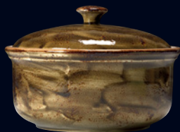
Casserole 0337 3 (104 oz) Lid 0338 3