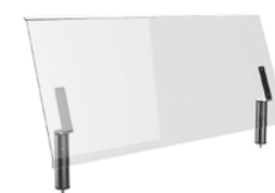
MGCIAN05XSXX Modular High Profile Acrylic Breath Guard w/ Opening Stainless Steel L 71" H 35 1/2" w/ 6" Gap