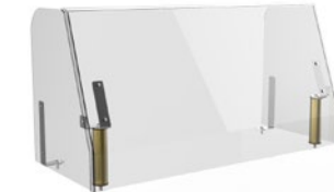
MGCIAN08XBXX Modular High Profile Full Acrylic Breath Guard with End Panels Brushed Brass L 71" H 35 1/2" D 28 3/4"