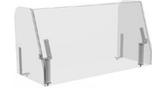
MGCIAN08XSXX Modular High Profile Full Acrylic Breath Guard w/ End Panels Stainless Steel L 71" H 35 1/2" D 28 3/4"