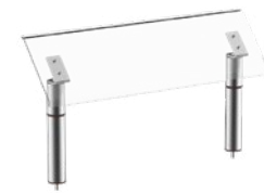
MGCIAN04XSXX Modular Self Service Breath Guard Stainless Steel L 47" H 24 1/2" w/ 14" Gap