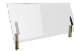
MGCIAN05XBXX Modular High Profile Acrylic Breath Guard w/ Opening Brushed Brass L 71" H 35 1/2" w/ 6" Gap