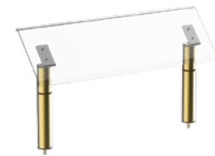
MGCIAN04XBXX Modular Self Service Breath Guard Brushed Brass L 47" H 24 1/2" w/ 14" Gap