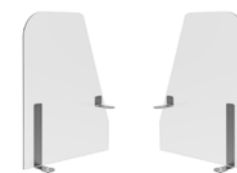
MGCIAN07XXXX End Panels w/ Adapters for Modular High Profile Acrylic Breath Guard Stainless Steel L 28 1/2" H 35 1/2"

Replacement Parts MGSADPL1701 Acrylic Panel w/ Opening for Modular High Profile Breath Guard L 71" H 32" MGSADPL1801 Set of Acrylic End Panels for Modular High Profile Breath Guard L 28 1/2" H 35 1/2" MGSADPL1901 Acrylic Panel for Modular High Profile Breath Guard L 71" H 35 1/2" MGSADSS1701 Set of Stainless Steel Adapters for Modular High Profile Breath Guard MGSADSS1801 Set of Stainless Steel Adapters for End Panels for Modular High Profile Breath Guard