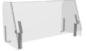
MGCIAN06XSXX Modular High Profile Acrylic Breath Guard w/ Opening and End Panels Stainless Steel L 71" H 35 1/2" D 28 3/4" w/ 6" Gap