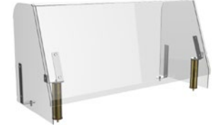
MGCIAN06XBXX Modular High Profile Acrylic Breath Guard w/ Opening and End Panels Brushed Brass L 71" H 35 1/2" D 28 3/4" w/ 6" Gap