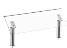
MGCIAN02XSXX Modular Self Service Breath Guard Stainless Steel L 47" H 18 1/2" w/ 8 1/2" Gap

Replacement Parts MGSADSS1001 1x Set of Adapter and Screw for Breath Guard MGSADPL0101 Acrylic Panel for 71" L Modular Self Service Breath Guard MGSADPL0201 Acrylic Panel for 47" M Modular Self Service Breath Guard