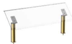
MGCIAN02XBXX Modular Self Service Breath Guard Brushed Brass L 47" H 18 1/2" w/ 8 1/2" Gap