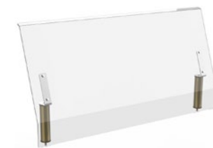
MGCIAN09XBXX Modular High Profile Full Acrylic Breath Guard Brushed Brass L 71" H 35 1/2"