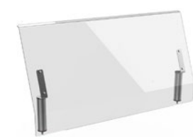
MGCIAN09XSXX Modular High Profile Full Acrylic Breath Guard Stainless Steel L 71" H 35 1/2"