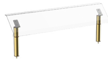
MGCIAN03XBXX Modular Self Service Breath Guard Brushed Brass L 71" H 24 1/2" w/ 14" Gap

Create an inviting, yet safe food service display with Mogogo's breath guards. Designed specifically for safety while ensuring function, quality and aesthetics, these breath guards are available as attachments to Mogogo's existing modular carts which include self-service and high profile. The self-serve guards are sized to protect the food while the high profile guards are intended for manned stations to shield both the staff and food. In harmony with high quality standards, these acrylic guards provide an ideal solution for the food & beverage industry.