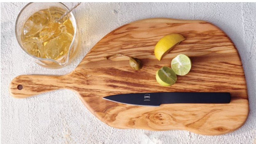
5796WP078 Paring Knife L 8" SS 6525TW301 Olive Serving Board Paddle L 15" W 7 3/4"