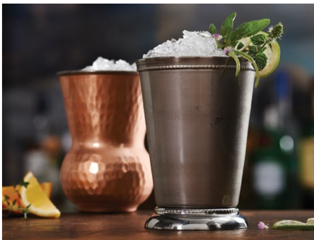
7340MW004 Mint Julep (12 oz) D 3 1/4" H 4 1/2" Stainless Steel