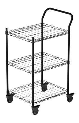
Charging Trolley Holds 6 Charging Platforms LMPTROLLEY