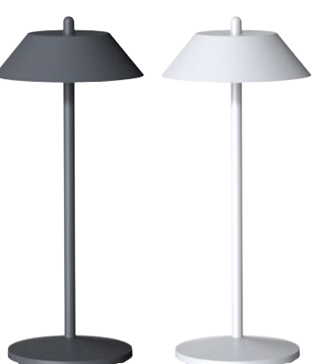
Pirlo Dark Gray Rechargeable Lamp LMPPIRGRY300 L 11" W 5 1/4" H 11"