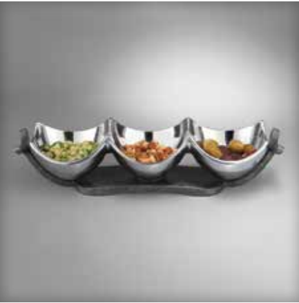
6741MB055 Anvil Trio Condiment 16" L X 4 1/2" W X 4 1/4" H (8 oz ea) DESIGNER Neil Cohen