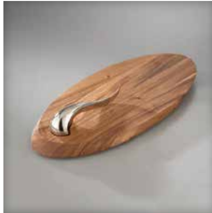
6752MB230 Swoop Cheese Board 21" L X 10" W W/ S/S Knife 8 3/4" DESIGNER Aaron Johnson