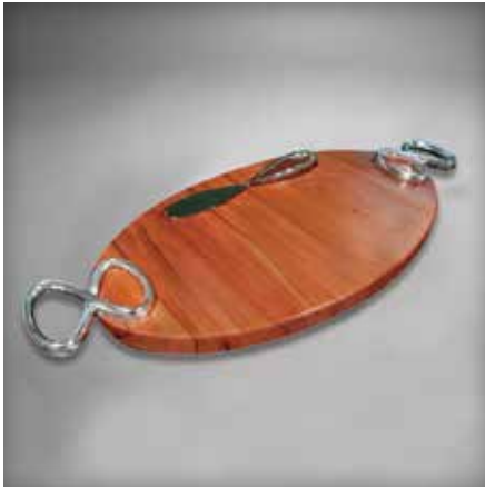
6750MB214 Infinity Cheeseboard 22 1/2" L X 10" W W/ S/S Knife DESIGNER Wei Young