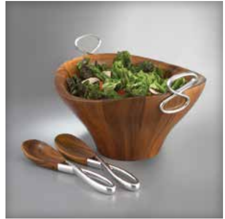
6750MB211 Infinity Salad Bowl 10" D X 10 1/4" H (236 oz) W/Servers 12" DESIGNER Wei Young