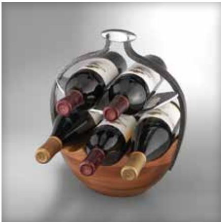
6751MB219 Anvil Wine Basket (Holds 5 Bottles) 11 3/4" D X 14" H DESIGNER Neil Cohen