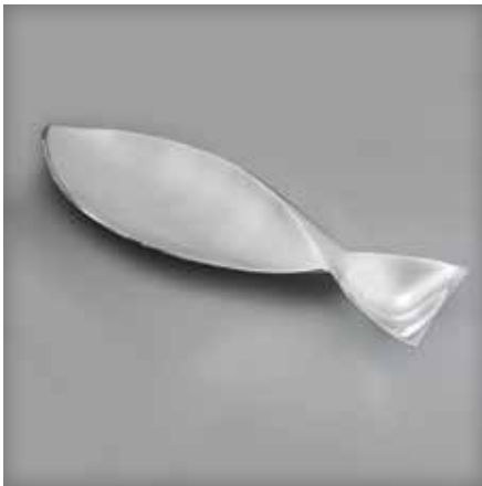
6740MB047 Fish Platter 25 1/2" L X 8" W 6740MB048 Minnow Fish Platter 18" L X 6" H DESIGNER Wei Young