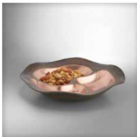
6744MB101 Divided Server (3 Sections) 12" D X 2 3/4" H (5 oz ea) DESIGNER Lisa Smith