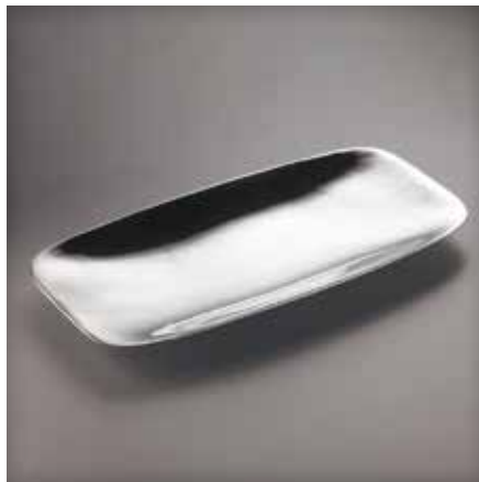
6740MB001 Marupa Platter 18" L X 9 1/2" W DESIGNER Nambé