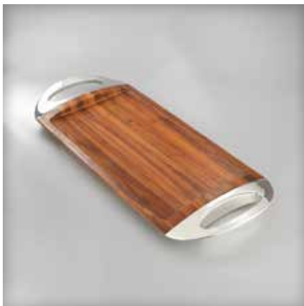
6752MB236 Grande Wood Tray 30" L X 12" W DESIGNER Wilt Oltman