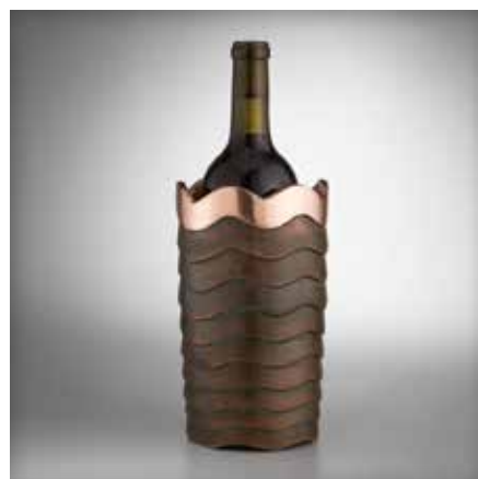
6744MB100 Wine Chiller 7 1/2" H X 4 1/2" D DESIGNER Lisa Smith