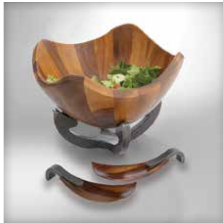
6751MB217 Anvil Scroll Salad Bowl W/Base and Servers 13" L X 11" W (169 oz) DESIGNER Neil Cohen