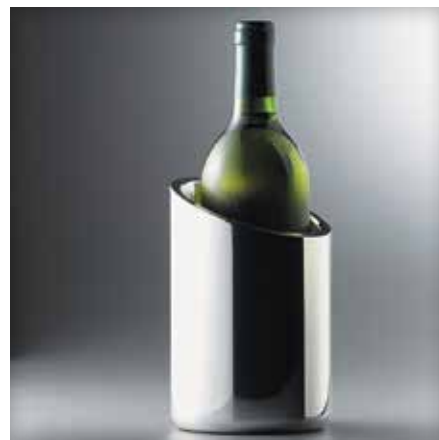
6740MB030 Tilt Wine Chiller 7" H X 4 1/2" D DESIGNER Nambé