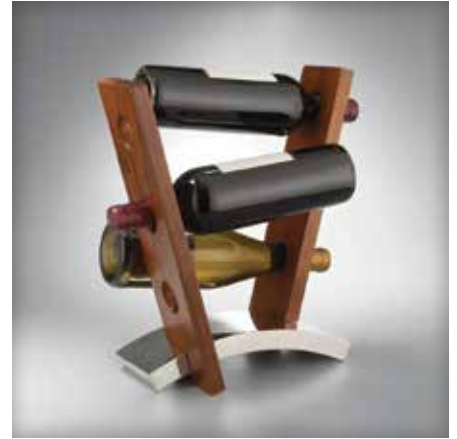
6752MB240 Joust Wine Rack (Holds 6 Bottles) 14" L X 5 3/4" W X 13 1/2" H DESIGNER Lou Henry