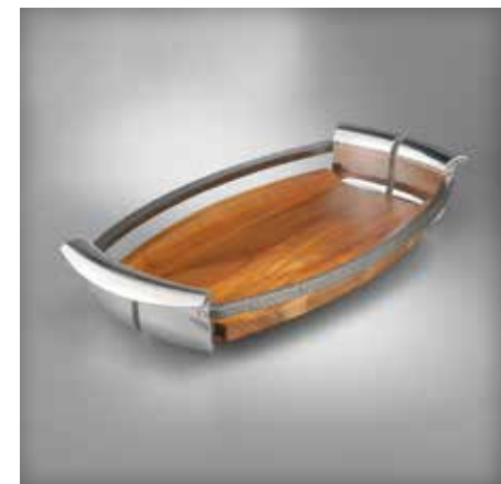
6751MB220 Anvil Tray 20" L X 12" W DESIGNER Neil Cohen