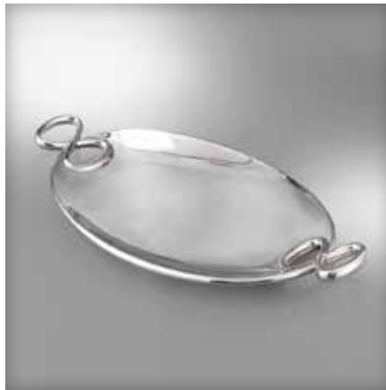
6743MB088 Infinity Platter 22" L X 12" W DESIGNER Wei Young