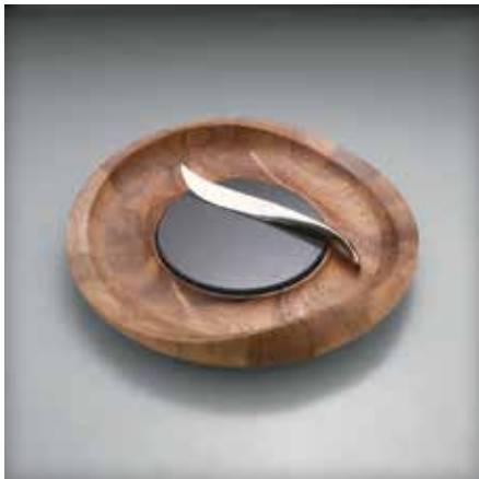
6752MB228 Butterfly Cheese Tray 14" D X 2 1/2" H W/ S/S Knife 9" DESIGNER Sean O'Hara