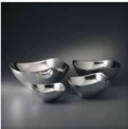
6740MB004 Tri-Corner Bowl 11" D X 5" H (100 oz) 6740MB005 Tri-Corner Bowl 9" D X 4 1/4" H (50 oz) 6740MB006 Tri-Corner Bowl 7 1/2" D X 4" H (33 oz) 6740MB007 Tri-Corner Bowl 6" D X 2 1/2" H (9 1/2 oz) DESIGNER Nambé