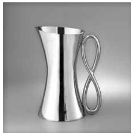
6743MB094 Infinity Pitcher 10 1/2" H X 7" D (2 qt) S/S DESIGNER Wei Young