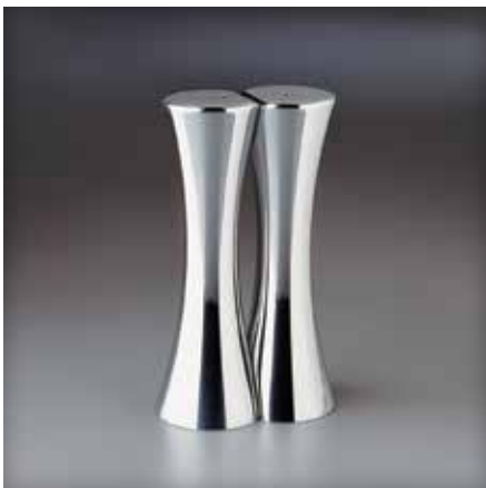
6740MB014 Kissing Salt & Pepper 5" H (1 1/2 oz ea) DESIGNER Karim Rashid