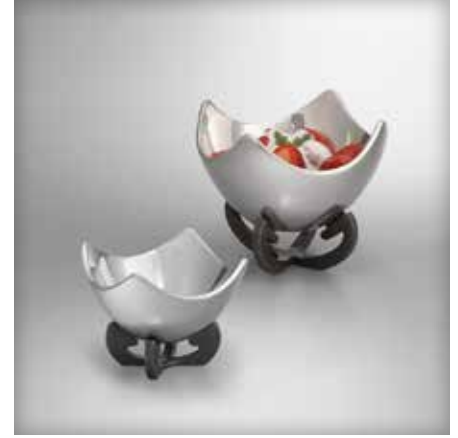
6741MB059 Anvil Scroll Bowl w/Base 9 1/2" D X 8 1/2" H (50 oz) 6741MB058 Anvil Scroll Bowl w/Base 7" D X 6" H (33 oz) 6741MB057 Anvil Scroll Bowl w/Base 5 1/2" D X 4 1/2" H (16 oz) DESIGNER Neil Cohen