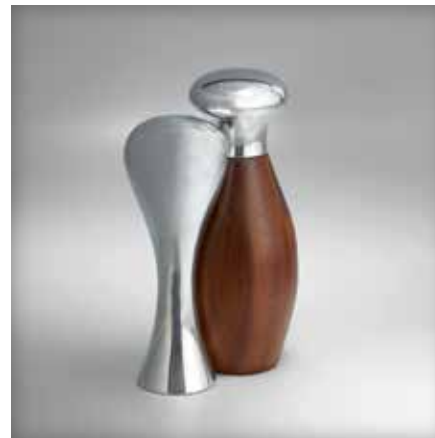
6747MB151 Monroe Salt Shaker & Pepper Grinder Set (Salt 7 1/4" H, Pepper 8 1/4" H) DESIGNER Neil Cohen