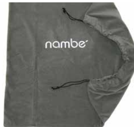
6749MB208 Felt Storage Bag 15" X 15" 6749MB209 Felt Storage Bag 19" X 12" 6749MB210 Felt Storage Bag 20" X 20"

All products are subject to availability. For further details of items available in each pattern please refer to the latest price list or contact your customer service representative.