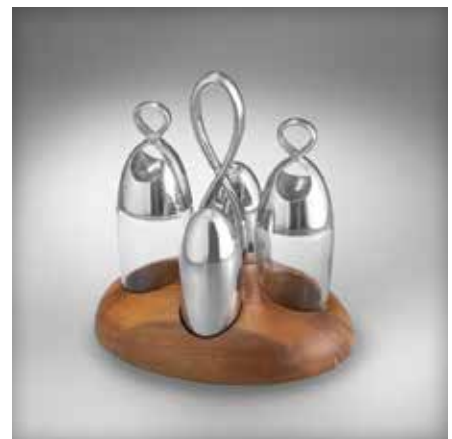
6750MB212 Infinity Salt & Pepper, Oil & Vinegar Set 8" L X 6" W X 9" H DESIGNER Wei Young