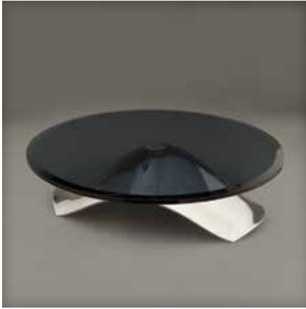
6740MB044 Morphik Cake Plate 14" D X 4" H DESIGNER Todd Meyers