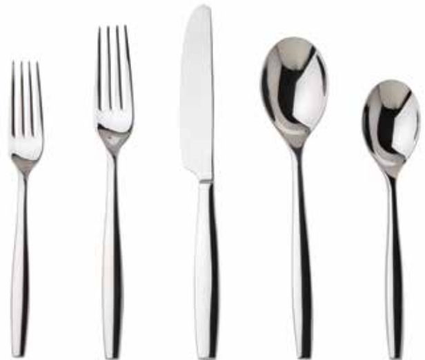
Dessert Fork 7 1/8" Table Fork 8 1/4" Table Knife 9 1/4" Tablespoon 8" US Teaspoon 6 7/8"