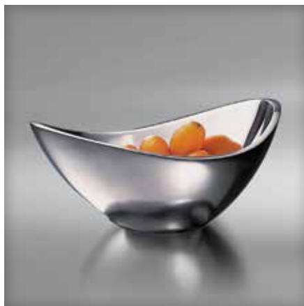
6740MB011 Butterfly Bowl 10 1/2" L X 9 1/4" W X 5 1/2" H (66 1/2 oz) 6740MB012 Butterfly Bowl 9" L X 7 1/2" W X 4" H (33 oz) 6740MB013 Butterfly Bowl 7 1/2" L X 6 1/2" W X 3 3/4" H (16 oz) DESIGNER Richard Thomas