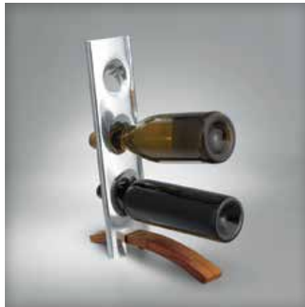
6752MB244 Tilt Wine Rack 14 1/2" H X 11" L DESIGNER Lou Henry