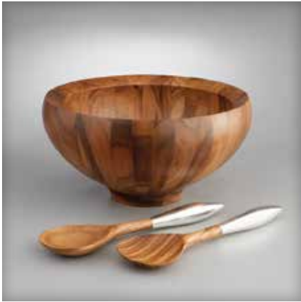
6752MB223 Yaro Salad Bowl 14" D X 7" H (64 oz) W/Servers 13" DESIGNER Sean O'Hara