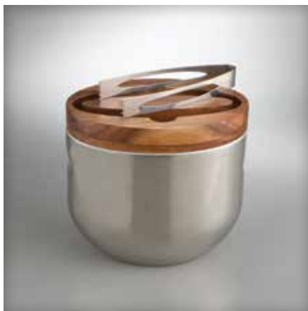
6752MB238 Mikko Ice Bucket w/Tongs 8" L X 6" W X 8 1/4" H DESIGNER Neil Cohen