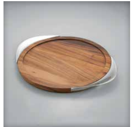
6752MB235 Tilt Bar Tray 17" D DESIGNER Todd Meyers