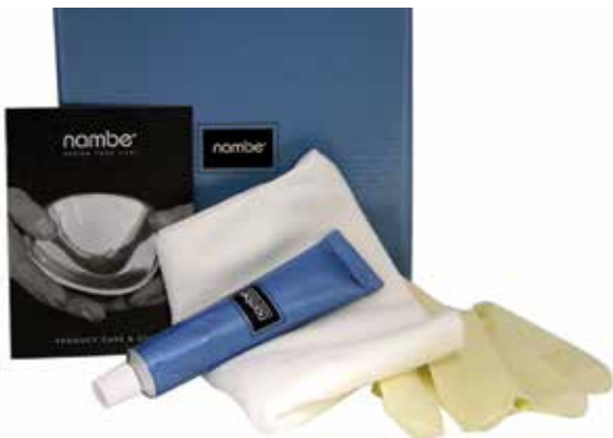
6749MB206 Polish Kit (Inc 2 oz Polish Tube, Micro Polishing Cloth & Latex Gloves) 6749MB207 Polish Tube (2 oz)