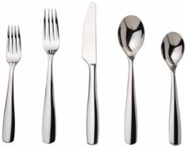
Dessert Fork 7 3/8" Table Fork 8 1/2" Table Knife 9 1/2" Tablespoon 7 7/8" US Teaspoon 6 3/4"