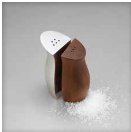
6752MB241 Cradle Salt & Pepper Set 5" H DESIGNER Steve Cozzolino