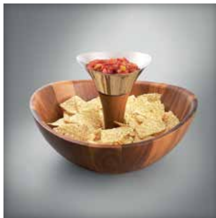
6747MB181 Harmony Chip & Dip 11 1/2" L X 12" W X 6 1/2" H (Bowl 96 oz, Dip 8 oz) DESIGNER Wei Young