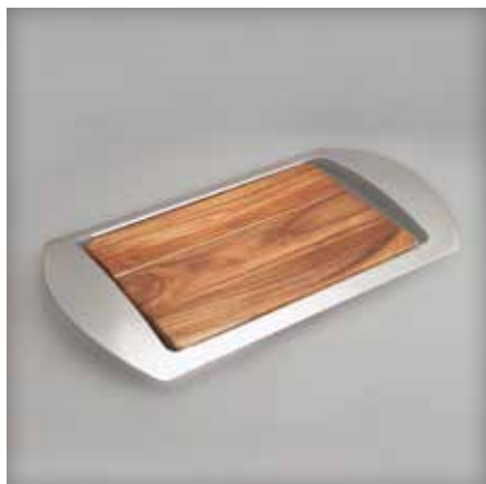
6752MB239 Mikko Bar Tray 19" L X 10 1/2" W DESIGNER Neil Cohen