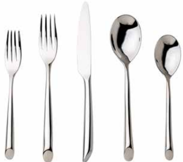
Dessert Fork 7 1/4" Table Fork 8 3/8" Table Knife 9 3/8" Tablespoon 7 7/8" US Teaspoon 6 3/4"

All flatware sold in 5 piece place settings.