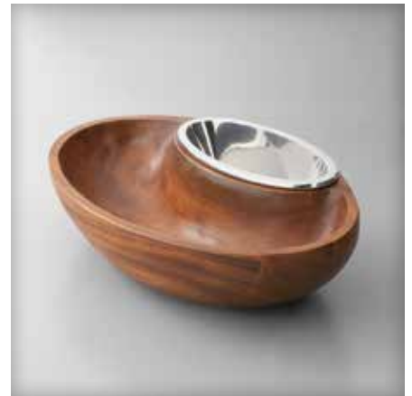
6752MB233 Dharma Chip + Dip 15" L X 9 1/2" W X 4" H (Dip 20 oz) DESIGNER Neil Cohen