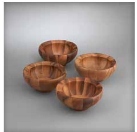
6752MB224 Yaro Indiv Salad Bowl (Set of 4) 7" D X 3 3/4" H (36 oz) DESIGNER Sean O'Hara