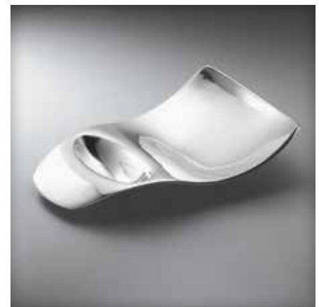
6740MB038 Lounge Chip & Dip 15" L X 9 1/2" W X 3 1/2" H (Large 14 1/4 oz, Small 5 oz) DESIGNER Neil Cohen