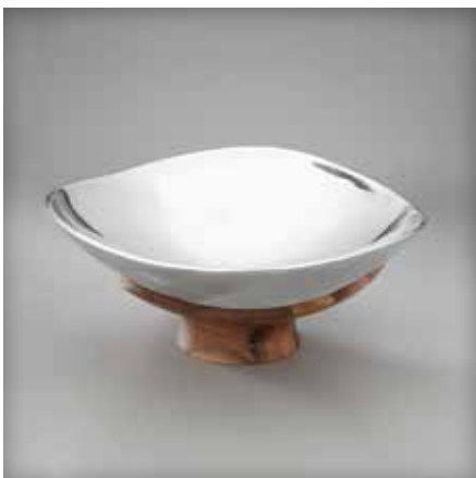
6752MB243 Cradle Pasta Bowl W/Wood Base 15" D X 10 3/4" H (162 oz) DESIGNER Steve Cozzolino