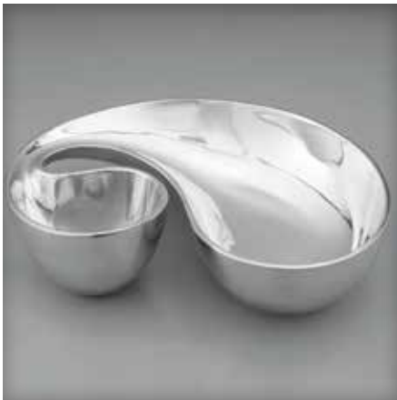
6740MB042 Morphik Chip & Dip 14" L X 12 1/2" W X 3 3/4" H (Dip 14 oz) DESIGNER Karim Rashid