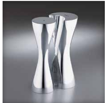
6740MB015 Hug Salt & Pepper 6" H (1 oz ea) DESIGNER Karim Rashid