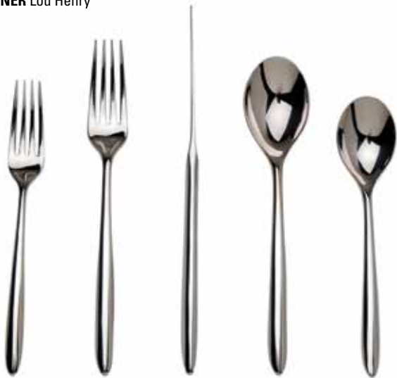
Dessert Fork 6 7/8" Table Fork 8" Table Knife 9 3/8" Tablespoon 8" U S Teaspoon 6 3/4"