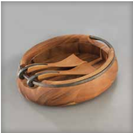
6751MB216 Anvil Salad Bowl 16" L X 13" W X 5" H (135 oz) W/Servers 12 1/2" DESIGNER Neil Cohen