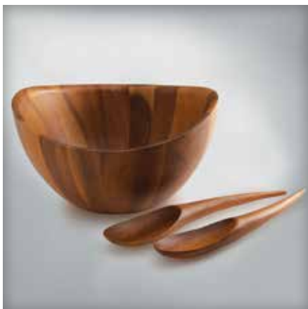
6747MB179 Harmony Salad Bowl 11 1/2" D X 6" H (152 oz) W/Servers 12" DESIGNER Wei Young

A variety of cookware, accessories, and small serving pieces, Gourmet has everything needed for the kitchen with Nambé's illustrious designs woven in for a creative touch.