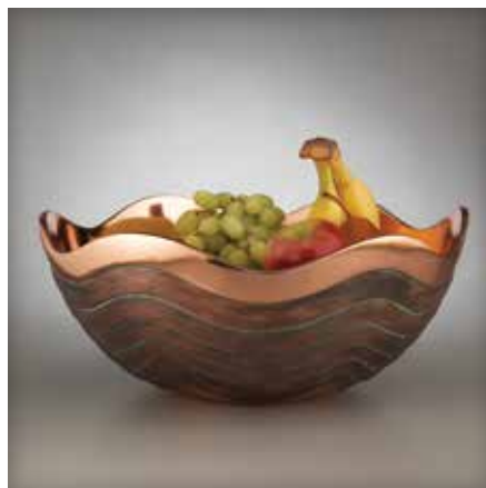
6744MB097 Bowl 13" D X 6" H (179 oz) 6744MB096 Bowl 10" D X 4 1/4" H (91 oz) 6744MB095 Bowl 7" D X 3" H (30 1/2 oz) 6744MB109 Bowl 6" D X 2 3/4" H (17 oz) 6744MB104 Bowl 5" D X 2 1/2" H (9 oz) DESIGNER Lisa Smith