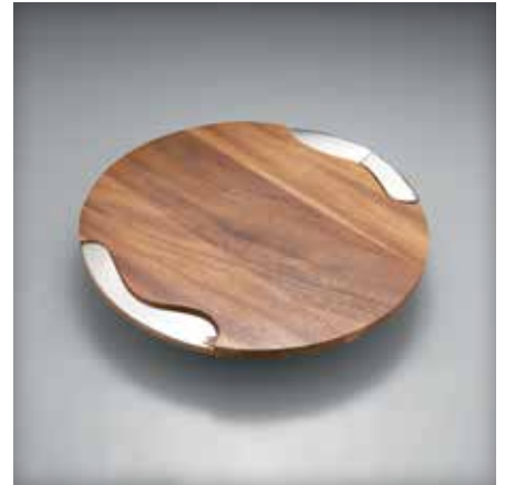
6752MB229 Cheese Block 15" D W/ S/S Knife & Spreader DESIGNER Neil Cohen