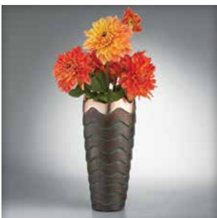
6744MB099 Vase 10" H X 4" D 6744MB098 Bud Vase 7" H X 2 1/2" D DESIGNER Lisa Smith