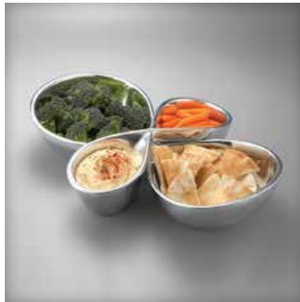
6743MB093 Infinity 2-Piece Server (4 Sections) 16" L X 12" W X 4" H (Large 25 1/4 oz, Small 10 oz) DESIGNER Wei Young