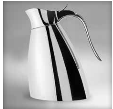
6747MB147 Flight Thermal Carafe 10 1/2" H (3 1/2 qt) DESIGNER Steve Cozzolino