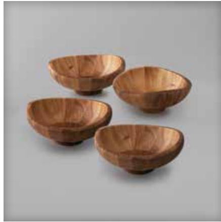
6752MB226 Butterfly Indiv Salad Bowl (Set of 4) 8 1/2" D X 3 1/4" H (38 oz) DESIGNER Sean O'Hara