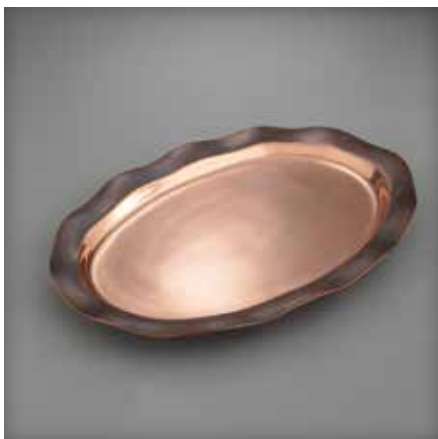
6744MB108 Oval Platter 15 1/4" L X 12 1/2" W DESIGNER Lisa Smith