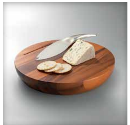
6747MB180 Harmony Cheeseboard 12 1/4" D W/ S/S Knife 10 3/4" DESIGNER Wei Young