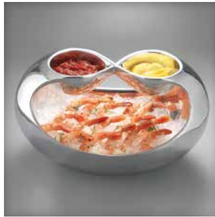
6743MB087 Infinity Double Dip 13" L X 9" W X 10" H (Large 101 oz, Small 8 oz) DESIGNER Wei Young