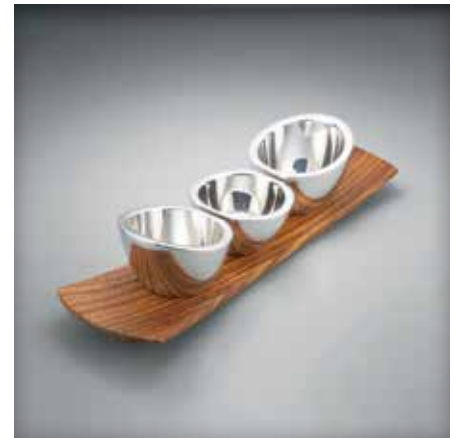
6752MB231 Trio Condiment Set 15" L (3 Bowls, 3 3/4 oz ea) DESIGNER Neil Cohen