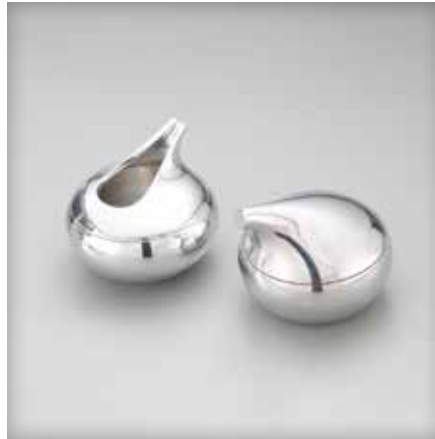
6747MB143 Kurl Sugar & Creamer Set 3" X 3" ea (8 oz ea) DESIGNER Karim Rashid