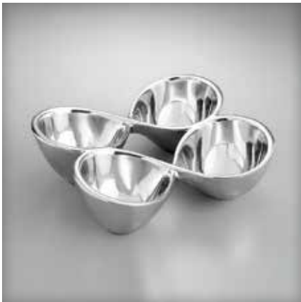
6743MB092 Infinity 4 Section Hors D' Oeuve Tray 9" L X 8" W X 3 1/2" H (6 oz) DESIGNER Wei Young