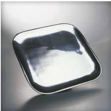
6740MB008 Square Service Plate 11" 6740MB009 Square Salad Plate 9" DESIGNER Nambé