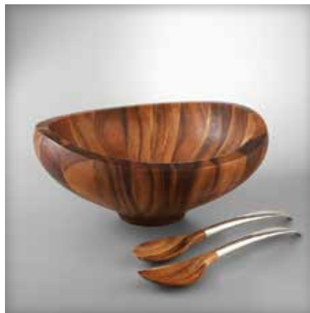
6752MB225 Butterfly Salad Bowl 16" D X 6 3/4" H (64 oz) W/Servers 14" DESIGNER Sean O'Hara