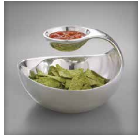
6740MB045 Scoop Server 11" D X 8" H (Top 6 3/4 oz, Bottom 83 oz) 6740MB049 Mini Scoop Server 7" D X 5 1/2" H (Top 2 oz, Bottom 20 oz) DESIGNER Wei Young