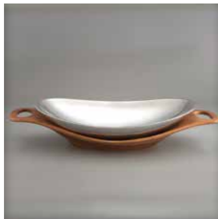
6752MB237 Cradle Serving Bowl W/Wood Base 14 1/2" L X 3" H (50 3/4 oz) DESIGNER Steve Cozzolino