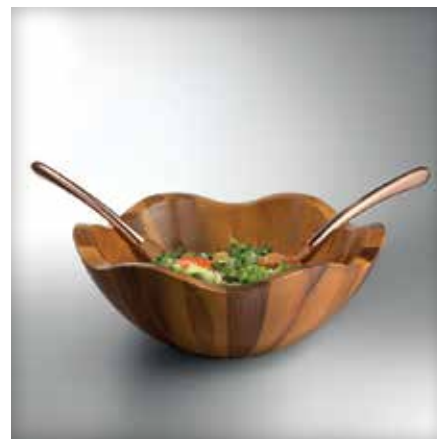
6744MB111 Salad Bowl 15" D X 7 1/2" H (169 oz) W/Servers 13" DESIGNER Lisa Smith