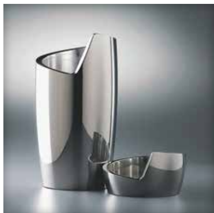
6740MB021 Chiller/Server 8 1/2" H X 4 1/2" D 6740MB020 Spiral Wine Coaster 2 1/2" H X 4 1/2" D DESIGNER Lisa Smith & Linda Celentano