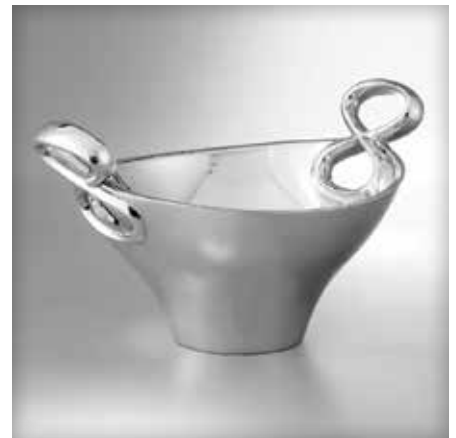
6743MB086 Infinity Bowl 10" D X 7" H (50 3/4 oz) DESIGNER Wei Young