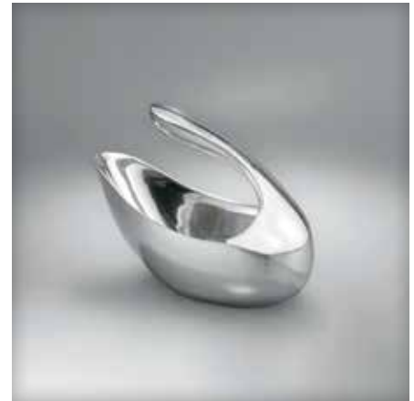
6747MB149 Gravy Boat 8" L X 4" W X 7 1/4" H (16 oz) DESIGNER Wei Young