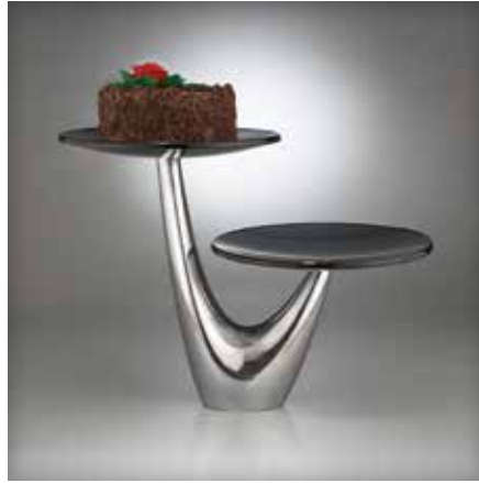
6740MB043 Morphik 2-Tier Riser 12" H (10" D Risers) DESIGNER Karim Rashid