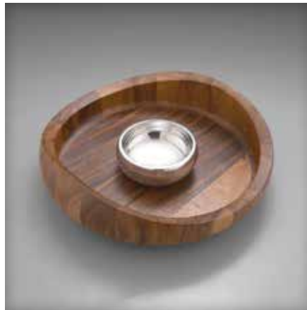
6752MB227 Butterfly Chip + Dip 16" D X 4 1/2" H (Bowl 16 oz) DESIGNER Sean O'Hara